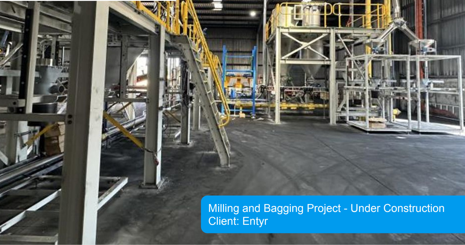
Milling and Bagging Project - Under Construction Client: Entyr